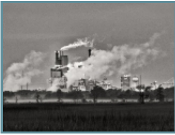
Savannah Plant, Pre-Dawn by