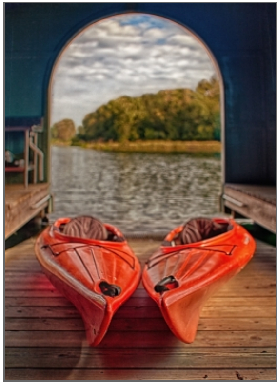
First Place, Expert