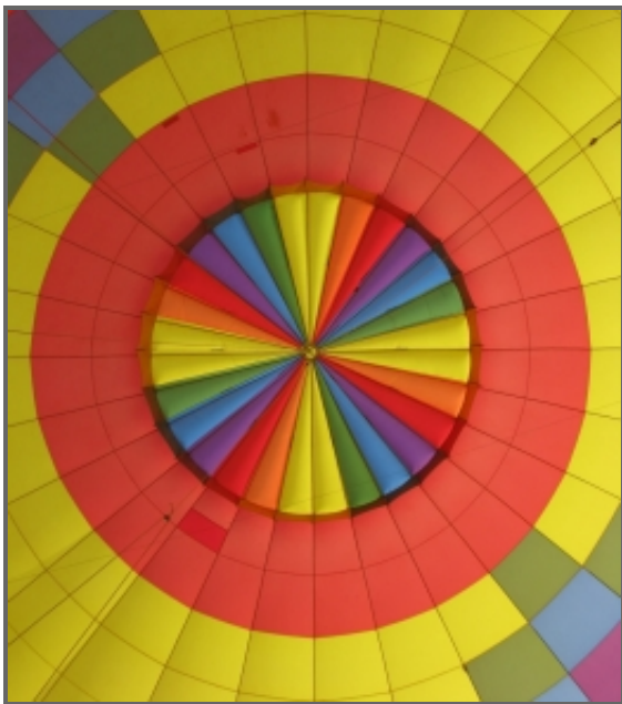
First Place, Novice