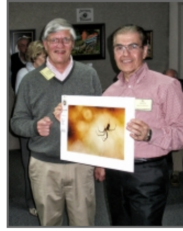
3rd place Orb Weaver by Al Heacox