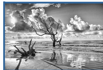
Morning Solitude, Lynn Long