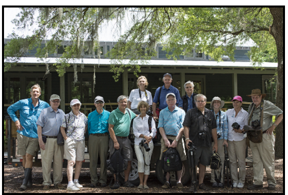
Spring Island field trip, May 27

If you are attending the banquet, remember: the evening also includes our Year-End Photo Contest. This year the theme is White, Red and Blue (no flags). Members attending the dinner will vote on their choice and the winner will be announced before the end of the evening. There is no need to send your file by email, just bring your print. Same rules as the monthly competition apply.