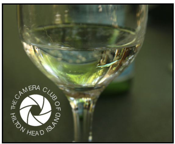
Annual Banquet - Registration Deadline Extended!

The deadline for registering for the CCHHI annual banquet has been extended to Friday June 5 .