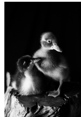
Acceptance: Consociation in Black and White , by Chandler Hummell