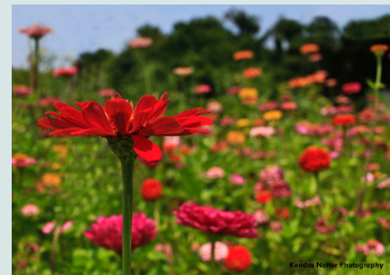
Burst of Colors Kendra Natter has been practicing shooting flowers from ground level, as a challenge to herself to capture the colors in the flowers and the sky.