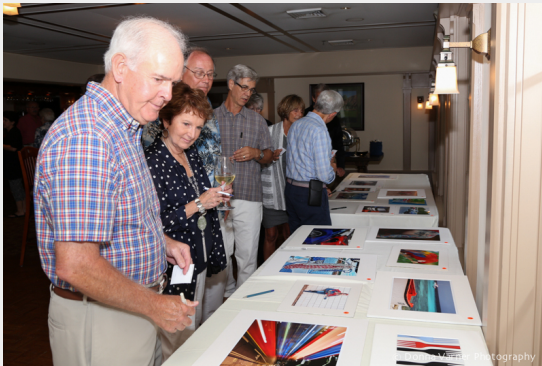
Photo of the Year

At the banquet, we will vote for the Photo of the Year . All pictures that have won an award (any ribbons) since January 2015 are eligible. To enter, simply bring your print(s) to the banquet.