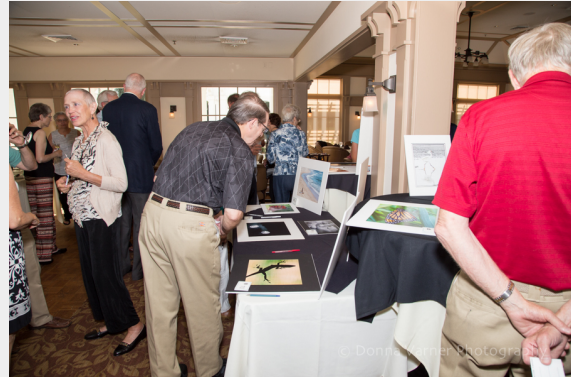
Most people agreed that choosing the best was difficult--so many good images!