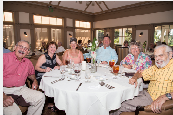
Great food and good company!