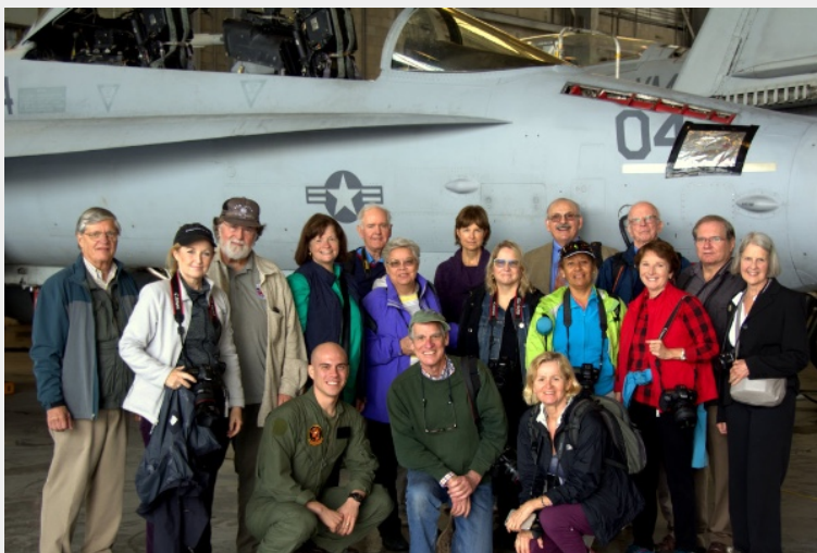
CCHHI members earn "Top Gun" status while touring the MCAS, Beaufort